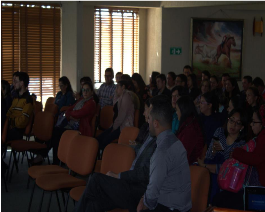
Language Twisters Night practice (pronunciation and practical fluency)